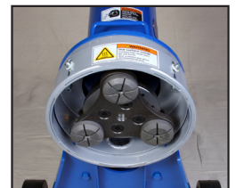
With tooling options and available adaptors, grind or polish with the BGS-250.